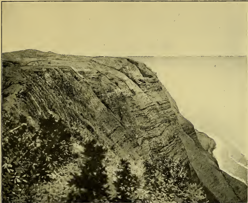
A. NORTH COAST OF MOLOKAI, LOOKING WEST FROM SUMMIT OF TRAIL TO LEPER SETTLEMENT.

Showing summit plateau and fault scarp, exposing a great number of basalt flows. Elevation 1,600 feet above sea level.